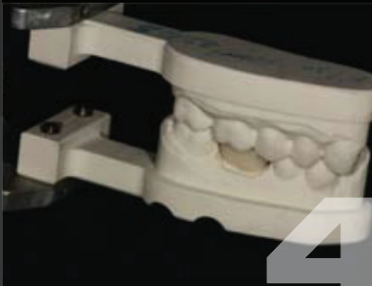
STEP 4 CAM model created by core3dcentres