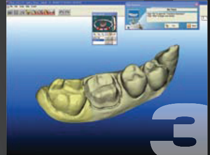
STEP 3 CAD model created by laboratory