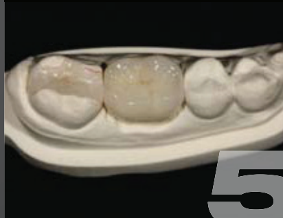
STEP 5 Final restoration created by laboratory