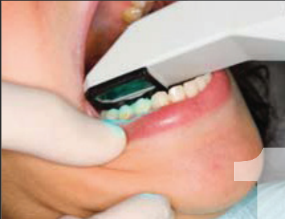
STEP 1 Digital scan by dentist